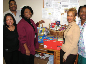
Members of the CCBOH Child Health Services Department pose on Nov. 23 with Thanksgiving food donations gathered for needy Clayton families.