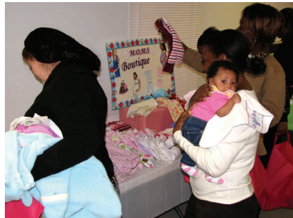
Young mothers receive donated clothing items and gifts on Nov. 4 during a workshop for the Making Our Mothers Successful (M.O.M.S.) program.