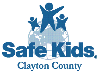
The logo for the Safe Kids Clayton County program.